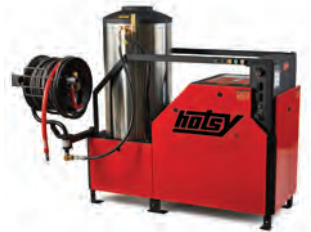
Black Label version comes with hose & hose reel